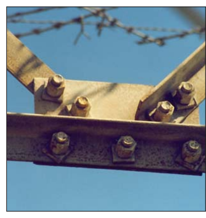
Site No 3. General condition of the tower after 25 years of service. A subsequent paint coating (providing a duplex coating system), has been recommended in order to extend the life of the structure.

fundamentals, viz, type and quality of the protective coating and environmental conditions in which the structure is located.