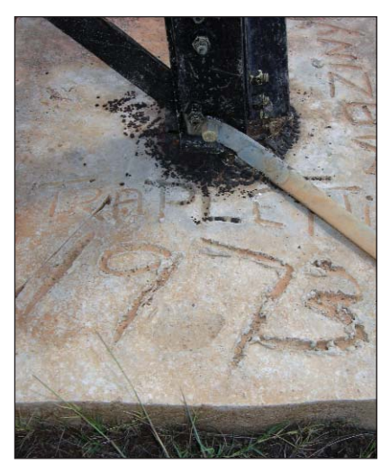
53kV DC line from Cahora Basa to Eskom's Apollo sub-station south of Pretoria.