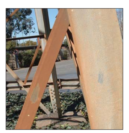
Site No 2. After the removal of the discoloration, i.e. corrosion products, the hot dip galvanized coating thickness measured to be 119 \mu m.