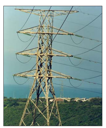
Severe marine coastal conditions. Buffalo-Port Rex Transmission line situated in East London. At the time of the coating inspection, the towers had been in service for about 25 years.