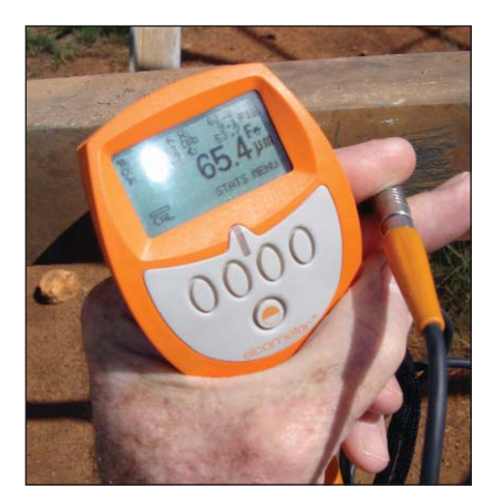
Site No I. – After removing the "apparent" rust discoloration, the underlying hot dip galvanized coating measured 65,4 \mu m. Accuracy of the instrument is approximately 5%.