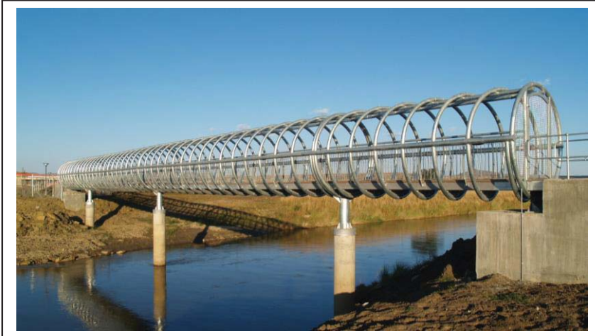
Ncome Museum Pedestrian Spiral Bridge Kwazulu Natal – the site of the Battle of Blood River 16 December 1838