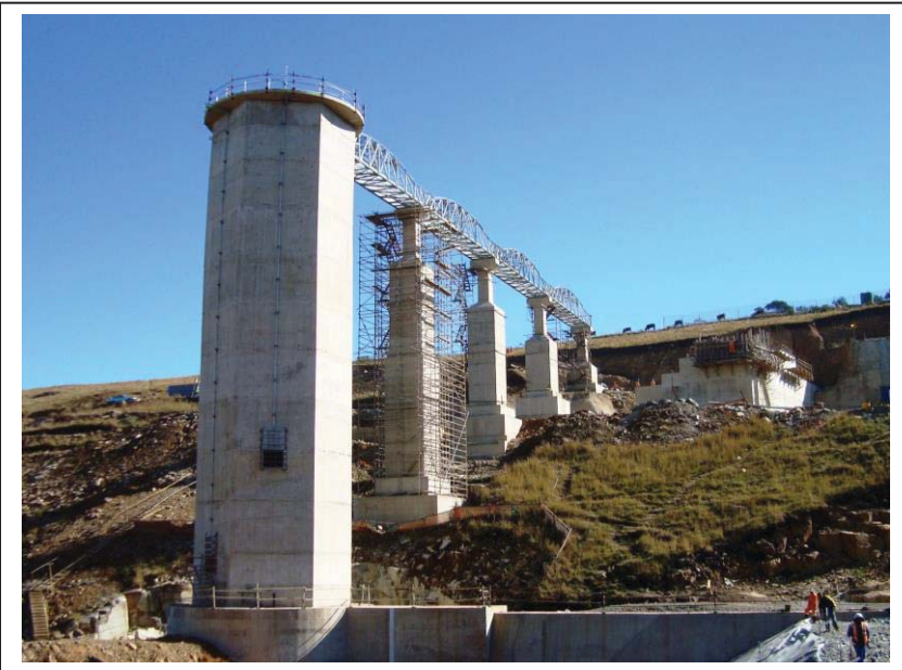
M1150 Ludeke Dam – Pedestrian Steel Bridge Eastern Cape