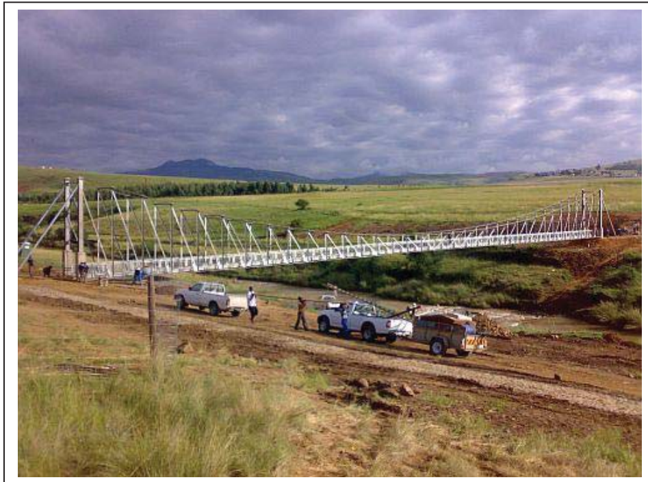
Bisi Pedestrian Bridge Kwazulu Natal, Umzimkhulu