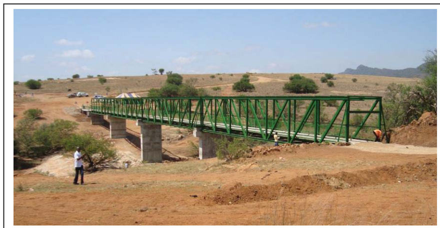
Ntombe River Bridge Hot Dip Galvanized and Painted Northern Kwazulu Natal – near the site of the Battle of Ntombe Drift 1879