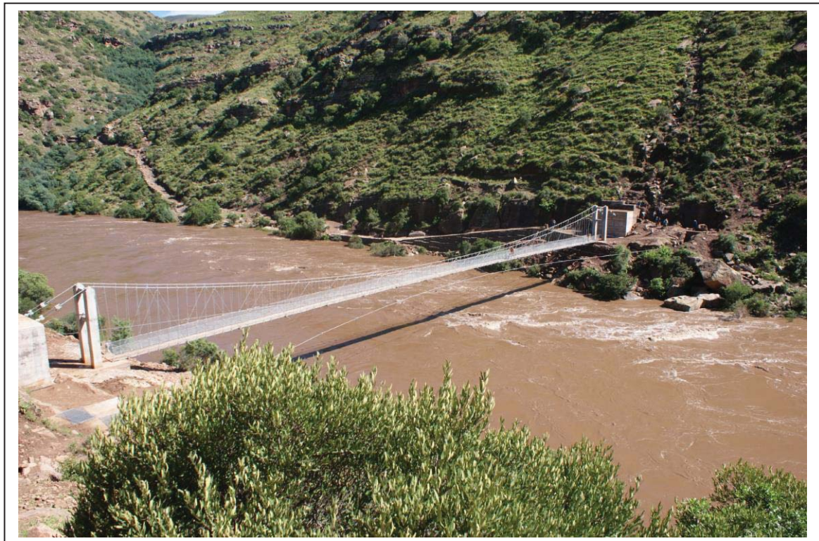
Ha Mofutho near Quasha's Nek, Lesotho, Senqu River

This case study is a review of some of these river crossings