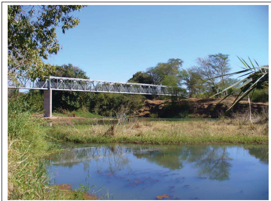
Makanise Bridge known as Pongola Bridge Kwazulu Natal Richards Bay area

Many of these bridge sites are located in remote areas with restricted access and infrastructural support. Bridges are manufactured of steel; fabricated in the main industrial centres, hot dip galvanized and road transported to the rural sites. Semi and unskilled crews are then used to erect the structure on the prepared foundations. Site activities using this type of structure are generally a lot easier than building the concrete equivalent.