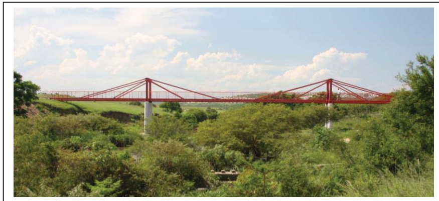
Zwelitsha Pedestrian Bridge over the Buffalo River Eastern Cape Hot Dip Galvanized and Painted