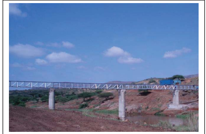
Sikwebezi Bridge – Kwazulu Natal