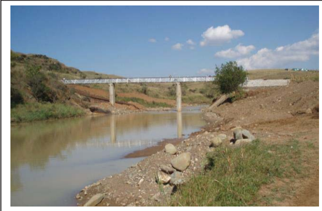
Insuze Bridge - Kwazulu Natal