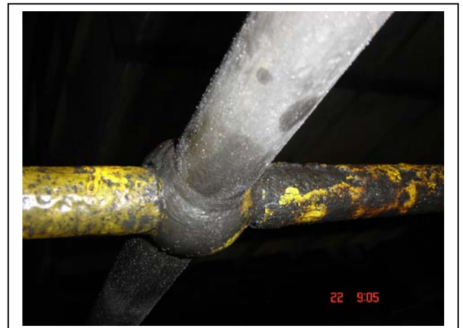
Two examples of the extent and severity of the corrosion conditions on painted steel