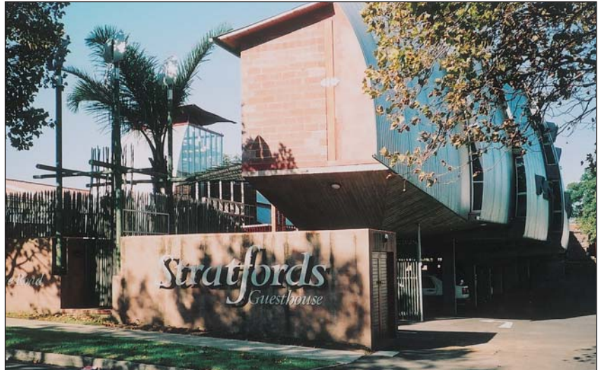
Entrance view showing the front laser cut hot dip galvanized signage, which has back lighting for illumination at night (photo taken in 2001).

Inspecting the hot dip galvanized coating in July this year the residual coating thickness readings taken on a number of components suggest that while the area of Vincent, East London is coastal, the environment is equal to about a C3 corrosion category in terms of ISO 9223 with the predictable corrosion rate of zinc being about 1 to 2µm per year.