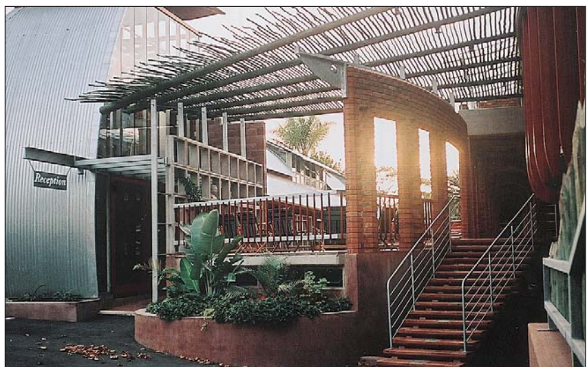
The north and south wing run parallel to each other and enclose a cloistered garden that terminates in a covered patio centre. The main dining room is on the right and the reception offices on the left. Note the timber banisters used to connect the hot dip galvanized steel hand rails (photo taken in 2001).