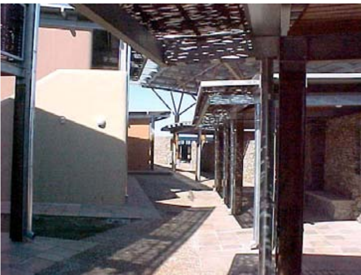
Lathe screens provide shade to building

The use of a modern material like steel with a centuries old material like stone masonry has shown just how well new and old can be combined.