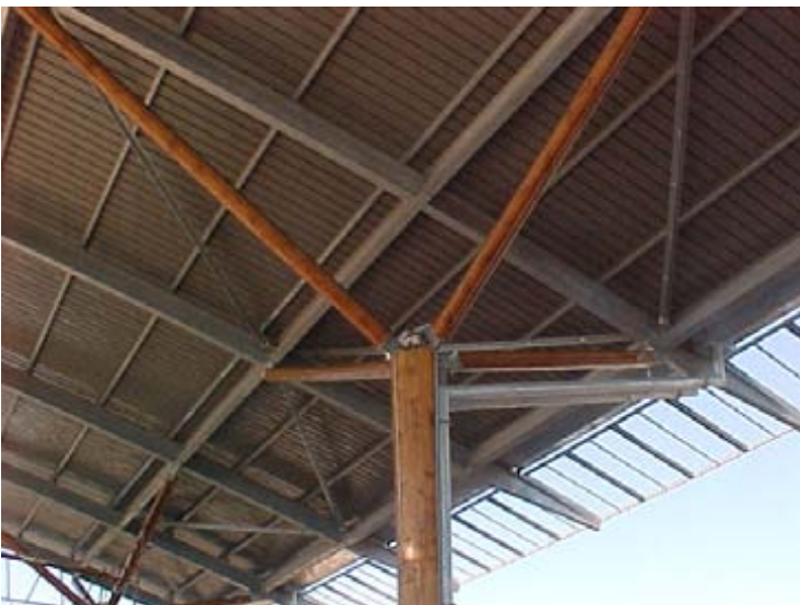
Hand crafted timber combines with steelwork

The diversity of skills was not limited to steelwork only. The six steel columns supporting the main canopy are formed by 20mm steel plate welded in a crucifix form. The four quadrants so formed are filled in with timber which has been decorated with fascinating pictures carved into the wood by artists from the Eastern Cape.