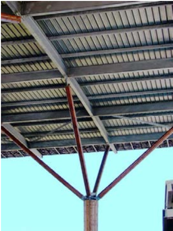
Slender supports to main canopy

This museum is really a celebration of the life of Nelson Mandela and the great role he played in guiding our country through transition and on to a road ahead.