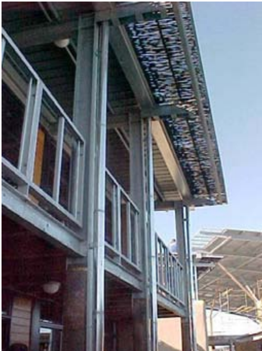
Front view of dormitory

To the left is the community hall and two buildings for the local manufacturing of items for sale to tourists. This will bring income into the village.