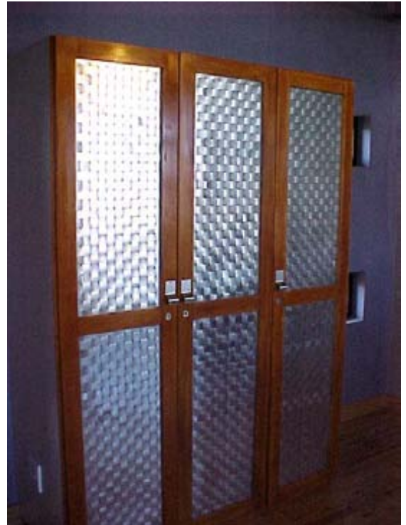
Hand woven galvanized doors

The diversity of skills was not limited to steelwork only. The six steel columns supporting the main canopy are formed by 20mm steel plate welded in a crucifix form. The four quadrants so formed are filled in with timber which has been decorated with fascinating pictures carved into the wood by artists from the Eastern Cape.