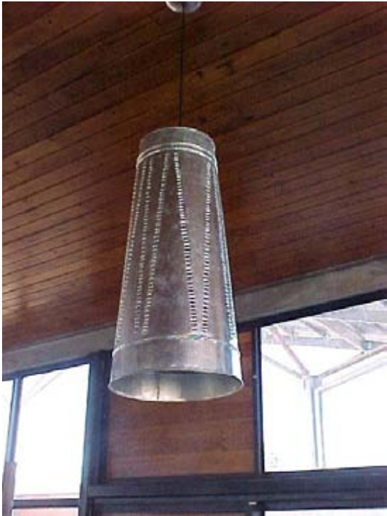
Hand crafted lamp shades

This project in a rural area created opportunity for local people to use their skills and receive payment for it. For example the lamp shades are hand crafted from galvanised steel sheet as well as the cupboard doors in the dormitories.