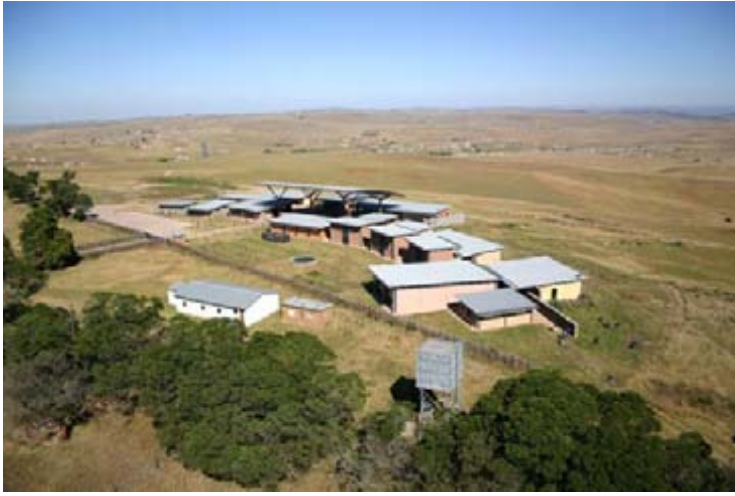
View from the North

This historical site, on the edge of the village of Qunu near Mandela's present house, is on the crest of the hills overlooking the remainder of the village.