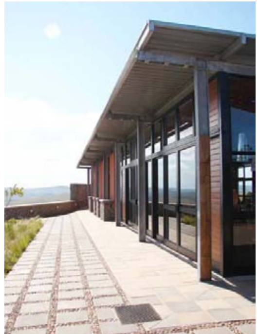
Front façade of restaurant