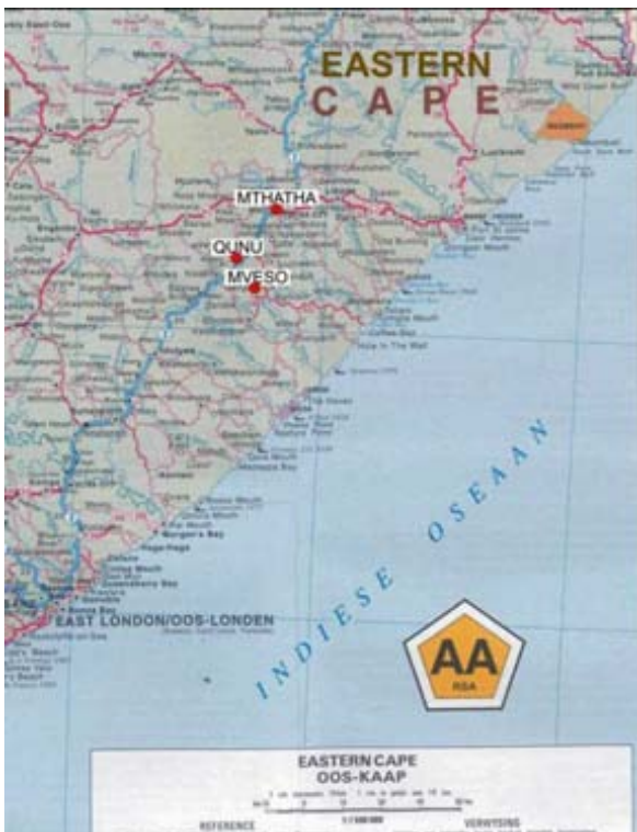
Location of museum

To honour South Africa's first fully democratically elected President, the Department of Public Works was tasked to build a museum complex in the former Transkei which would be a living reminder of our history. The building complex at Qunu together with the buildings at Mveso and Mthatha, form the Nelson Mandela Museum.