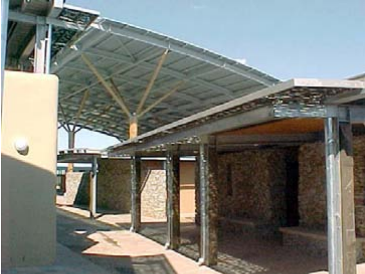
Combination of stone masonry walls & structural steelwork

The architectural theme for the buildings is to express the structural steel members outside the building and build the stone clad brick masonry walls within the structural shell.